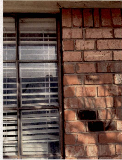
2 - 1