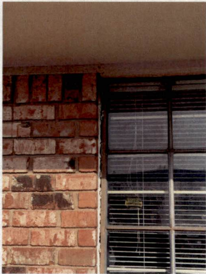
3 - 1